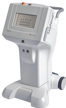
Eckert & Ziegler BEBIG Saginova® afterloader