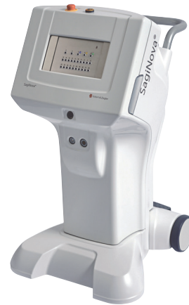
Eckert & Ziegler BEBIG Saginova® afterloader