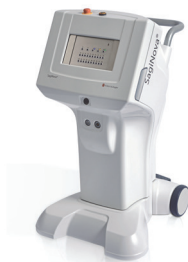
Eckert & Ziegler BEBIG SagiNova® afterloader