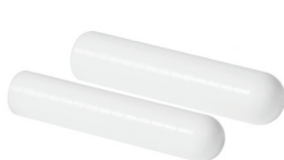
Domed build-up caps

The CT/MR Miami Applicator Set includes standard 30°, 0° and stump configurations to effectively treat a variety of anatomies. The 3.0 cm, 3.5 cm and 4.0 cm build-up cap cylinders and optional domes allow for enhanced source spacing, and the 7-channel design enables more precise dose distribution around circumference of the vagina.