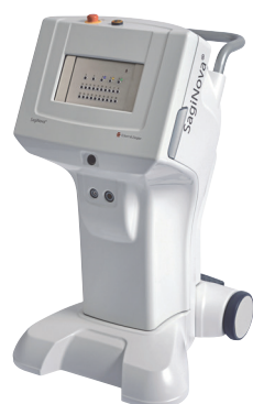
Eckert & Ziegler BEBIG SagiNova® afterloader