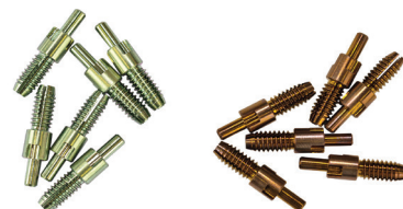
Obturator needle collets