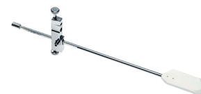
CT/MR rectal retractor