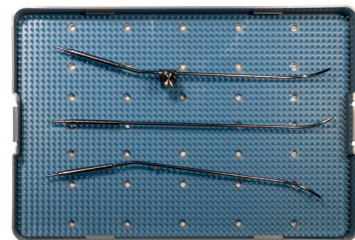
Sterilization box with select 2/3 Channel Endometrial Applicator Combo Set components