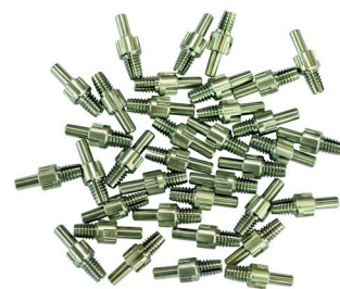
Template needle collets